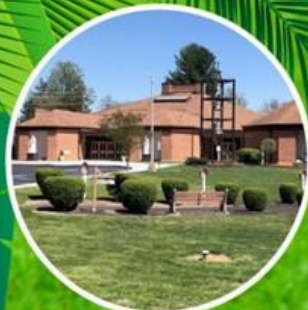
JULY 26TH ST. MARK, FALLSTON