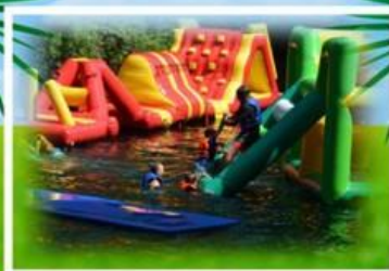
JULY 28TH FUN DAY, GUPPY GULCH - $27 PP