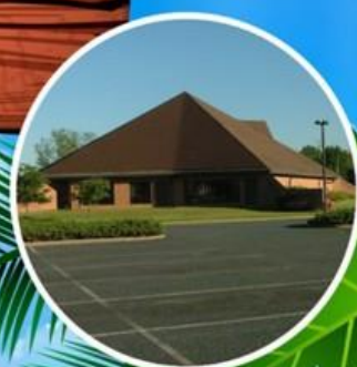
JULY 25TH HOLY SPIRIT, JOPPATOWNE