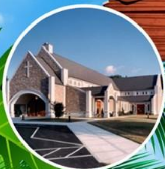
JULY 24TH ST. IGNATIUS, HICKORY