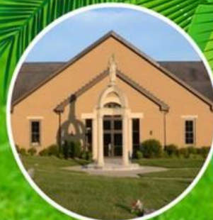
JULY 27TH ST. FRANCIS DE SALES, ABINGDON